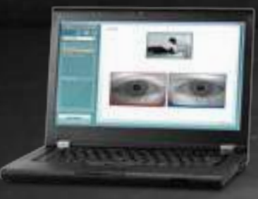
Synchronized videos of eye movements and patient movements